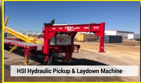
HSI Hydraulic Pickup & Laydown Machine

COLEMAN S/A Portable Generator/ Light Plant c/w STANFORD 5kw generator p/b KUBOTA D-850 3 cyl. diesel engine, (4) lights, leveling jacks, mtd. on S/A bumper pulled trailer, 13" tires