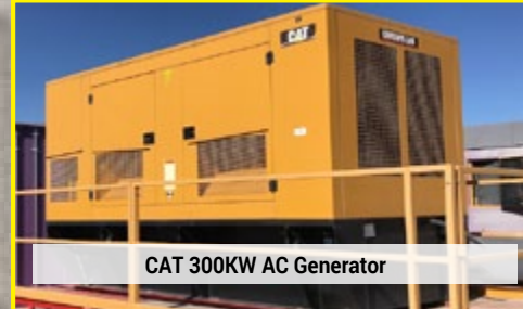
CAT 300KW AC Generator