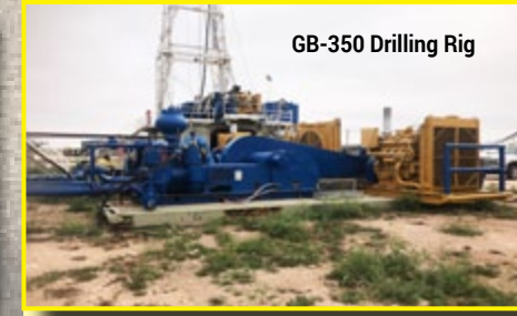
GB-350 Drilling Rig

HURRICANE 6T-276-42B/2000 Booster s/n PE4045Z006747, p/b CAT 3126 diesel engine (s/n BEJ15203, 1083 hrs)