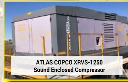
ATLAS COPCO XRVS-1250 Sound Enclosed Compressor

ATLAS COPCO XRVS-606-CD Sound Enclosed Compressor p/b CAT C-18 diesel engine (s/n WJH01637), mtd. in soundproof, insulated enclosure, (3364 hrs showing, s/n A1A1229723)