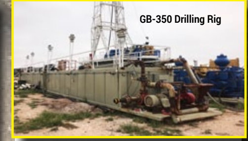
GB-350 Drilling Rig

2008 DIRECT 8'W x 48' OAL Step Deck Trailer c/w air ride susp., spread axle, inverted 5th wheel, disc wheels, 255/70R-22.5 tires, s/n 5UJD548288T000615